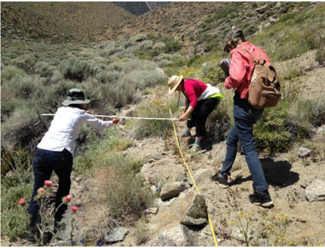
Volunteers at Tunawee Canyon