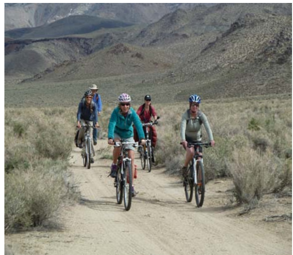
Bicycling Botanists