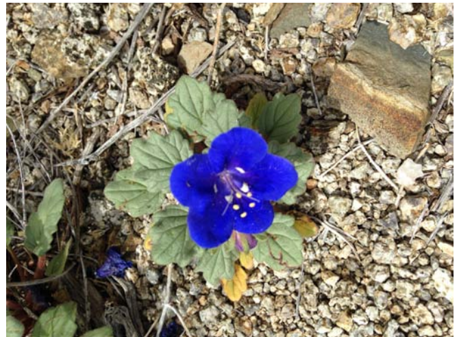
Charlotte's Phacelia ( Phacelia nashiana )