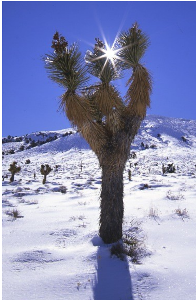
A perfect holiday tree—Joshua Flats in the Inyo Mountains named for this impressive tree belonging to the agave family