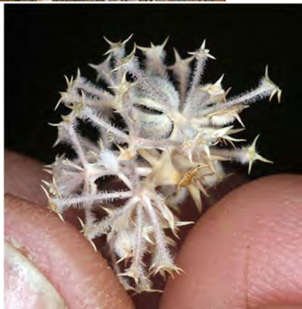
Oreonana clementis not in fruit yet (top). The spectacular fruit of O. clementis (bottom).