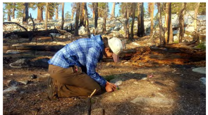
Measuring a pine seedling in the Big Five Fire (2014), Sequoia National Park.