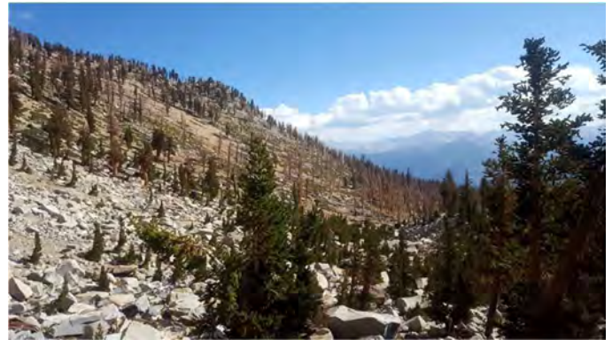
A great vantage on the Willow Fire (2007) in foxtail pine forest, Sequoia National Park.

changes at an unprecedented scale. Densifying forest stands combined with a trend in increasing size and upper elevation of fire in the Sierra Nevada may contribute to larger and more severe fire events in subalpine forests in the near future.