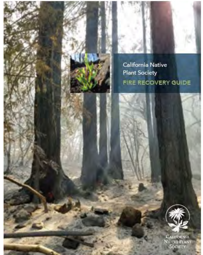
Cover of the first edition on CNPS' Fire Recover Guide.