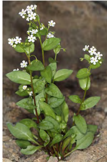
Hackelia Sharsmithii.