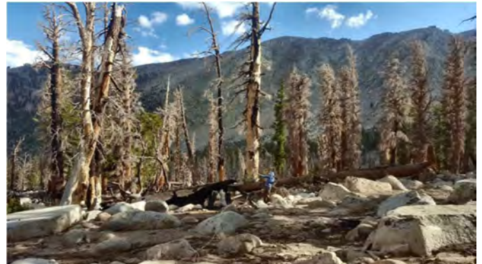
Using a basal area gauge to assess stand density in a burned foxtail pine forest in Sequoia National Park.

We sampled five fires in 2018 across a range of 2–16 years post-fire and in three different National Parks or Forests. We found that post-fire species richness (or total number of species) increased with fire severity and was greatest in stands that experienced >75% tree mortality by basal area. This