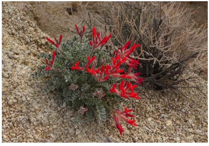
An Astragalus coccineus (scarlet milkvetch) in the Alabama Hills.

The Mary Dedecker Native Plant Garden in Independence is lovely any time of the year; always a nice spot to stop for a walk and enjoy some low-elevation indigenous plant life and wildlife. With the warmer weather, I've been spending time in the garden and out hiking. It's a great time for both activities!