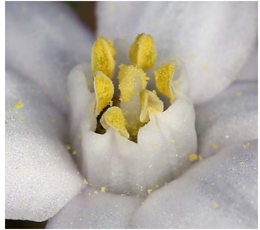
Muilla coronata (top) and its distinguishing feature, anthers atop broad filaments forming a crown around the pistil (bottom).