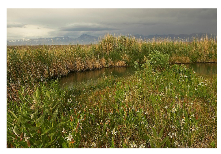
Sedges, grasses, showy milkweed (Asclepias speciosa), yerba mansa (Anemopsis californica), and Indian hemp (Apocynum cannabinum) grow along the banks of BLM Spring, Fish Slough ACEC, Eastern Sierra, CA.

Bristlecone members are familiar with Fish Slough as an Area of Critical Environmental Concern, a unique desert wetland in a watershed that has lost many of its important springs. This Area of Critical Environmental Concern is habitat for six threatened or rare plant species, including one described by Mary DeDecker in 1974. This is the Fish Slough milk vetch (Astragalus lentiginosus var. piscinensis) endemic to Fish Slough. Other plant species are alkali mariposa lily (Calochortus excavatus), alkali cordgrass ( Spartina gracilis ), hot spring fimbristylis (Fimbristylis thermalis), Great Basin centaurium (Centaurium exaltatum), King's ivesia (Ivesia kingii var. kingii), and silverleaf milk vetch (Astragalus argophyllus var. argophyllus). Fish Slough is also known for the Owens pupfish and Owens speckled dace.