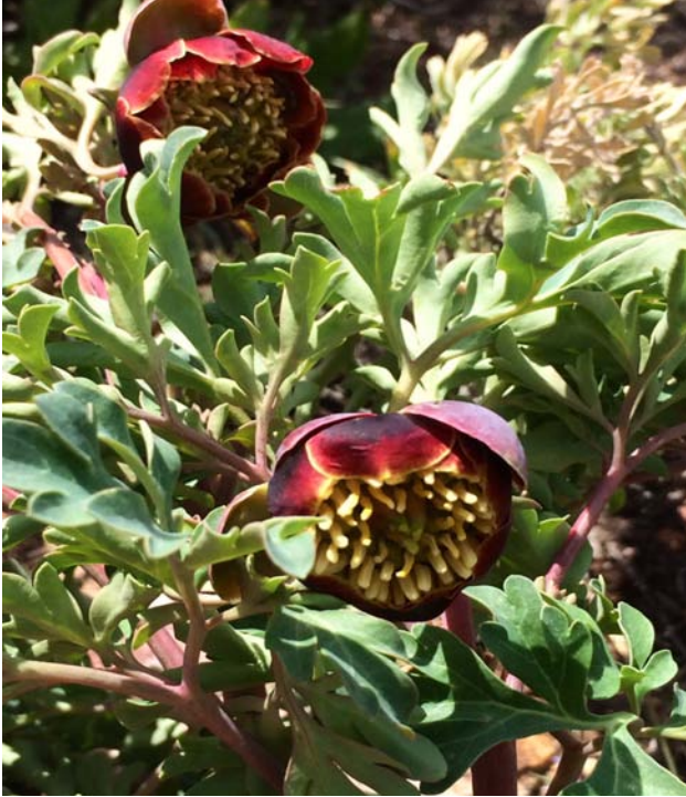
Brown's Peony