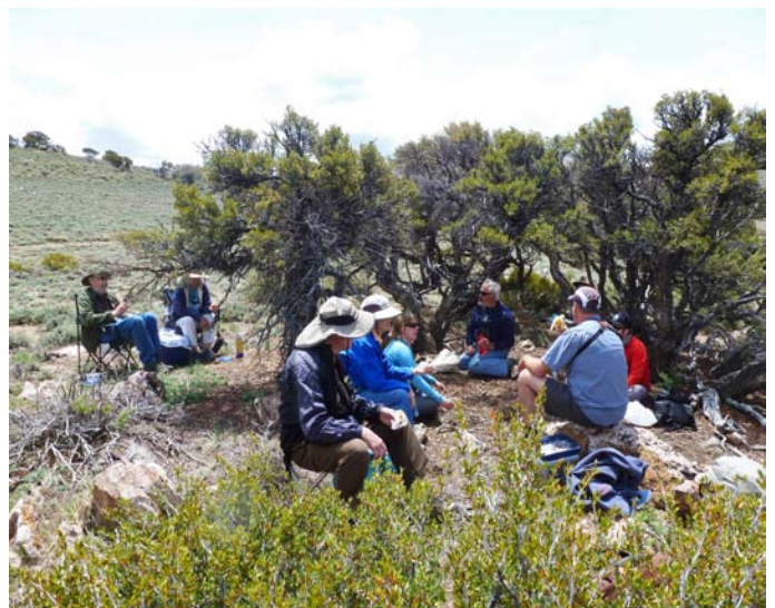
The Crew

With a third consecutive drought year, expectations for a spectacular bloom were not high, but the group was treated to a pleasing spectacle of wildflowers and blooming shrubs. Our first stop of the day was near the Cheung Mine, and Indian Paintbrush was growing in great profusion in the Low Sagebrush ( Artemisia arbuscula ). Also blooming in this area was Western Serviceberry ( Amelanchier alnifolia ) and Desert Peach ( Prunus andersonii ).