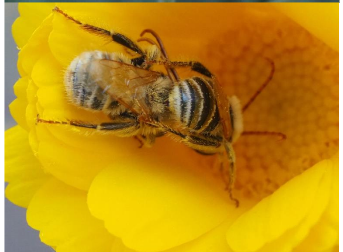
Bees in flower heads of Baileya multiradiata.