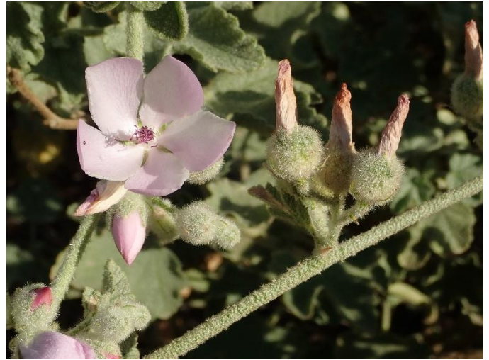
Malacothamnus orbiculatus .