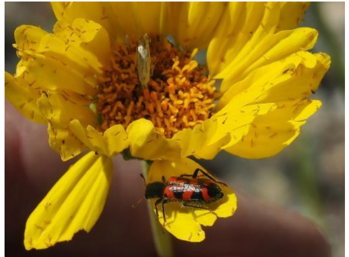
Diversity: Ornate checkered beetle, small moth, and western flower thrips.