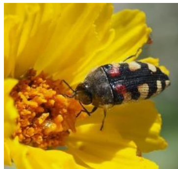
Top, northern white skipper ( Heliopetes ericetorum ) and, bottom, flower beetle (Buprestidae).