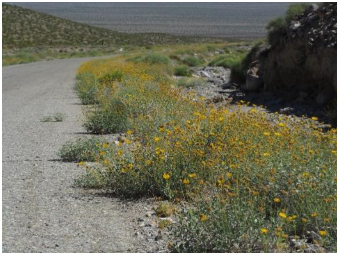
Brittlebush along Death Valley Rd. out of Big Pine.

Brittlebush ( Encelia actoni ) is an example of the increase in productivity of plants along vehicular routes. The increase in abundance has been attributed to many factors 1 . It has created an exciting habitat, with a diversity of insects and arthropods. Over 21 species from six orders of insects and some spiders were observed this spring on brittlebush along Big Pine Death Valley Rd. to Piper Mountain Wilderness. They have been observed collecting pollen and nectar, mating, and as predators and prey.