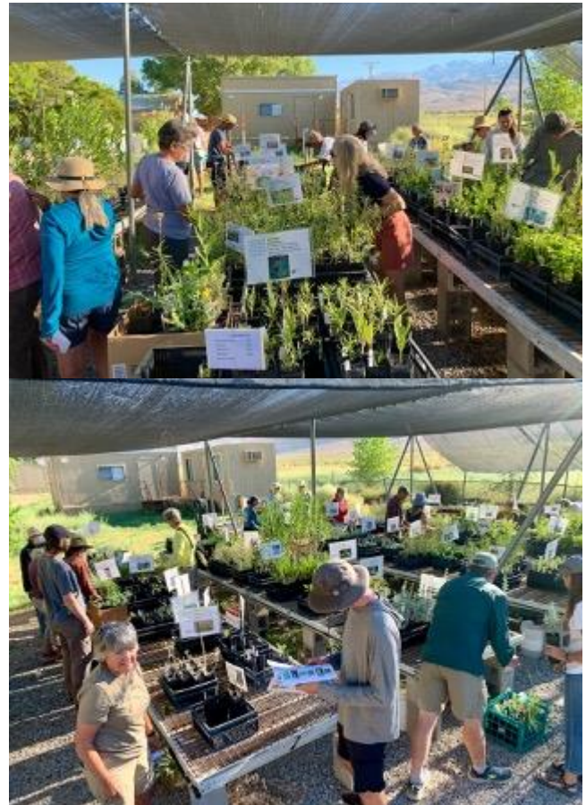
(Top and bottom) Plant shoppers perusing the selection of native plants at the Fall Sale at the White Mountain Research Center.